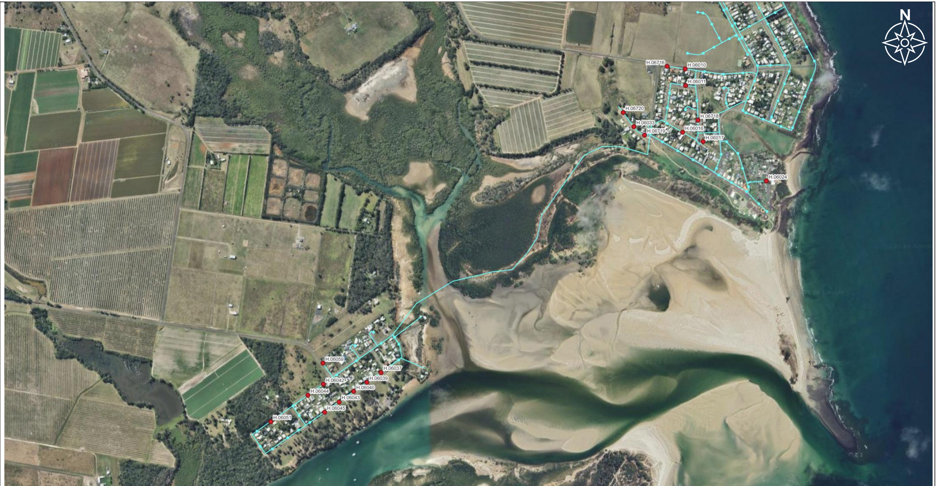
ELLIOTT HEADS HYDRANT FLOW TESTING PLAN SHEET 2 OF 2