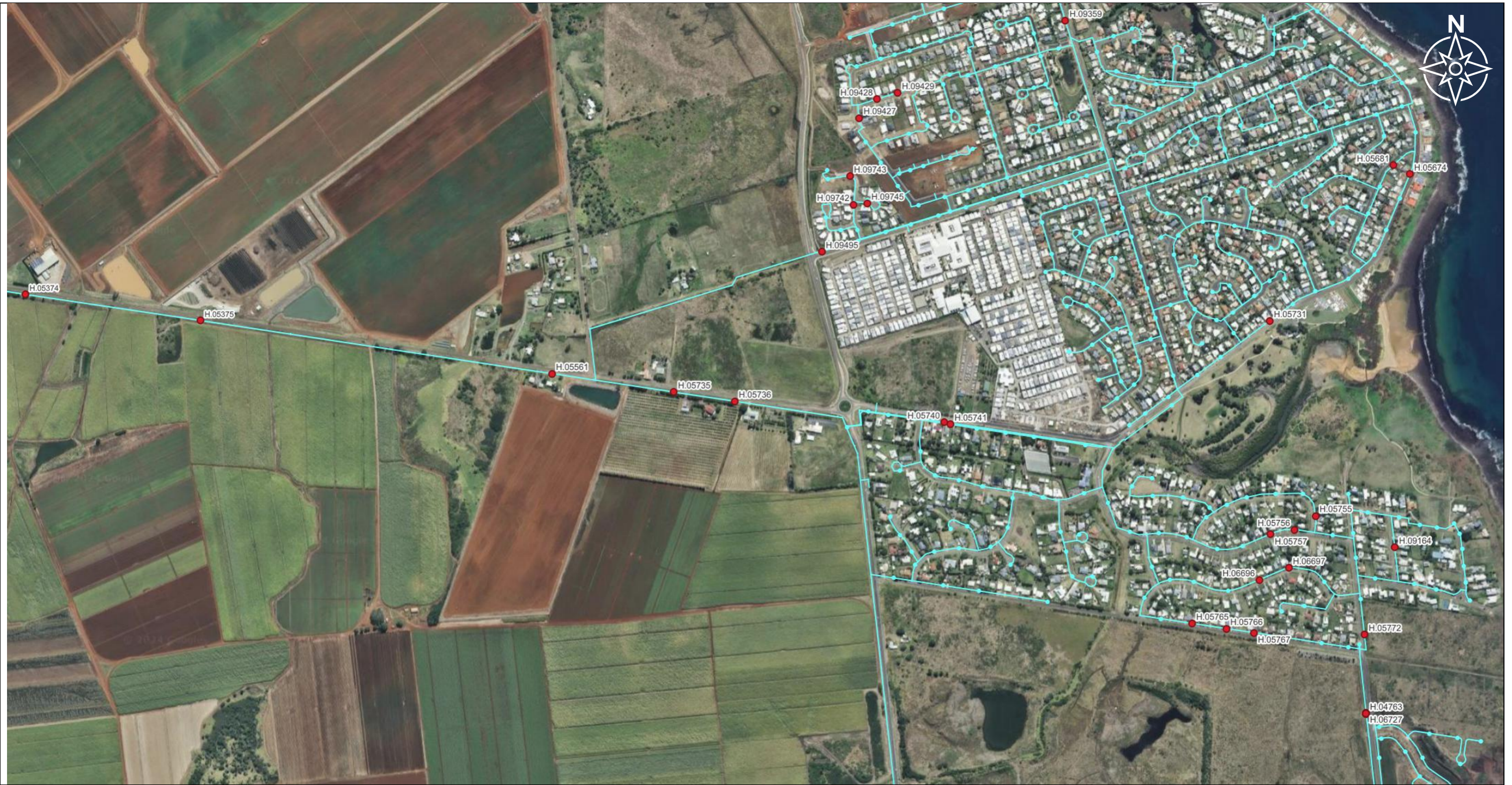
BARGARA HYDRANT FLOW TESTING PLAN SHEET 2 OF 2