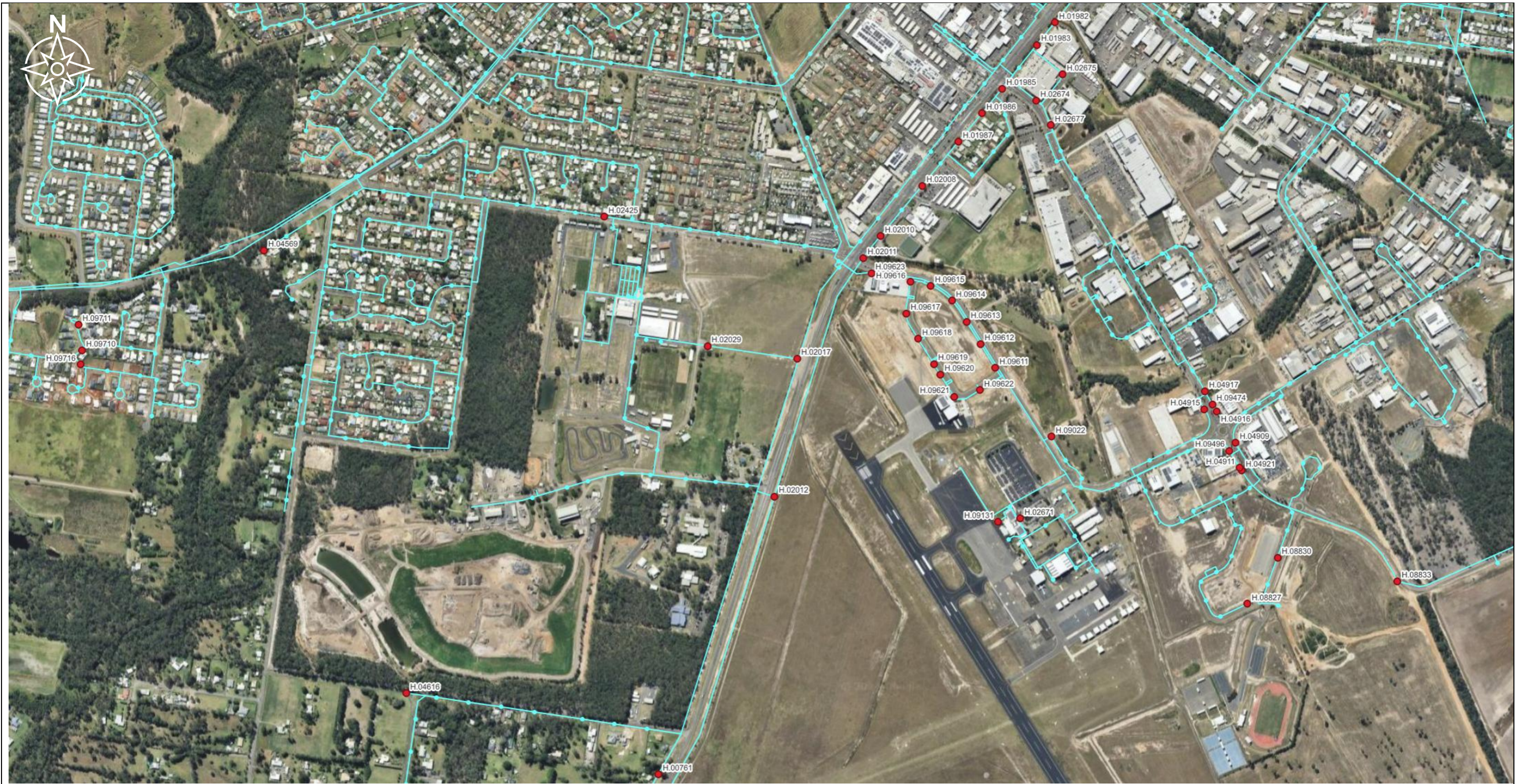
BUNDABERG WEST AND BRANYAN HYDRANT FLOW TESTING PLAN SHEET 1 OF 1