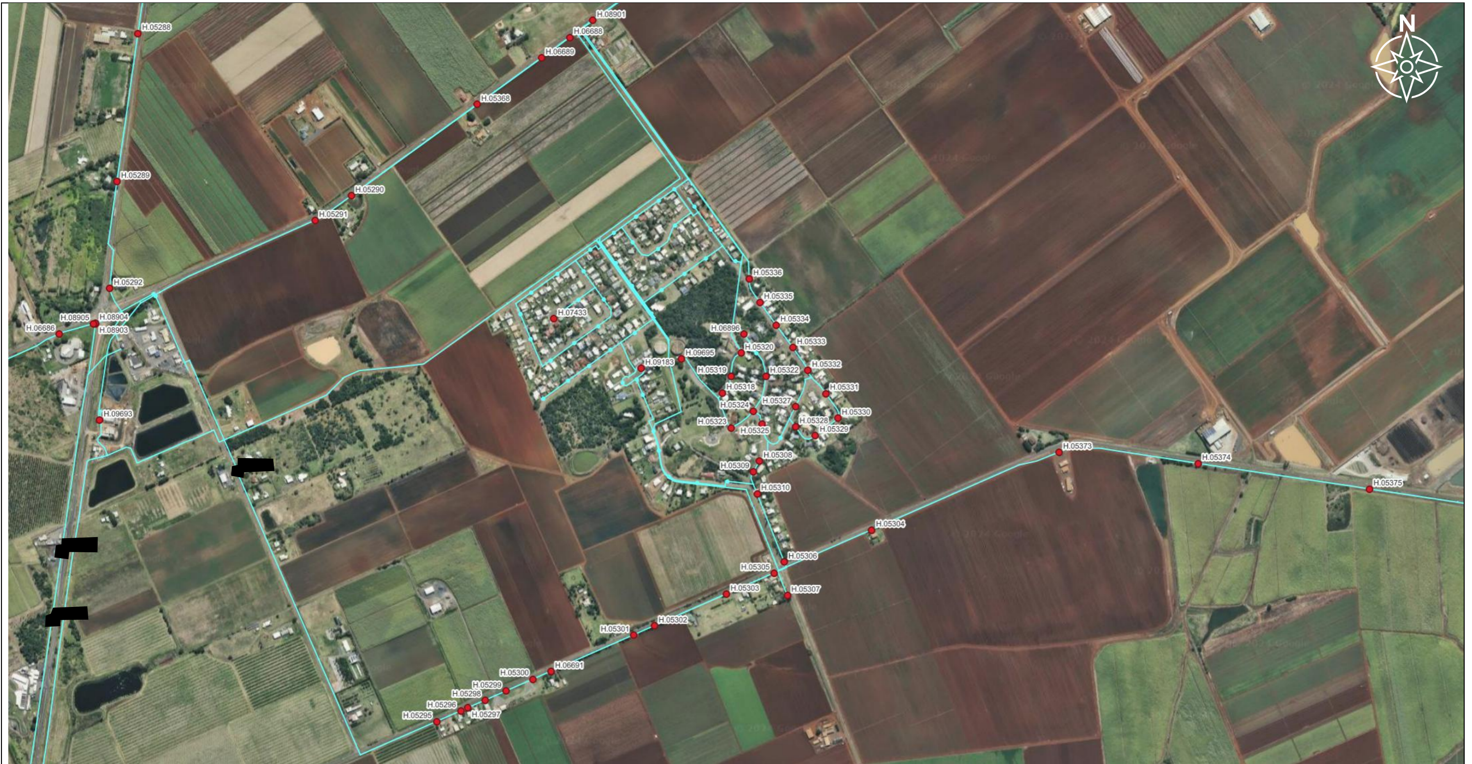
BUNDABERG EAST HYDRANT FLOW TESTING PLAN SHEET 2 OF 3