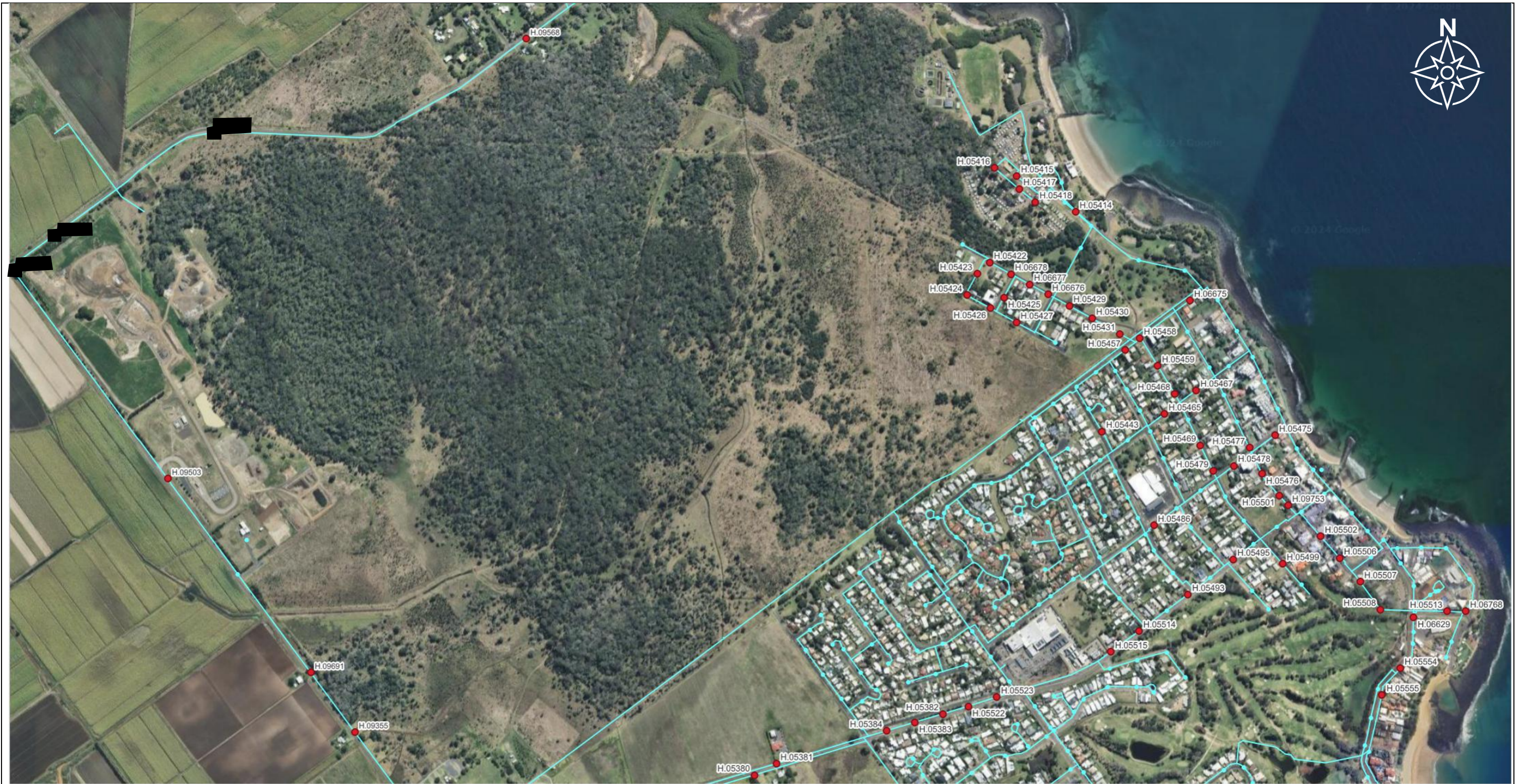
MON REPOS AND BARGARA HYDRANT FLOW TESTING PLAN SHEET 1 OF 1