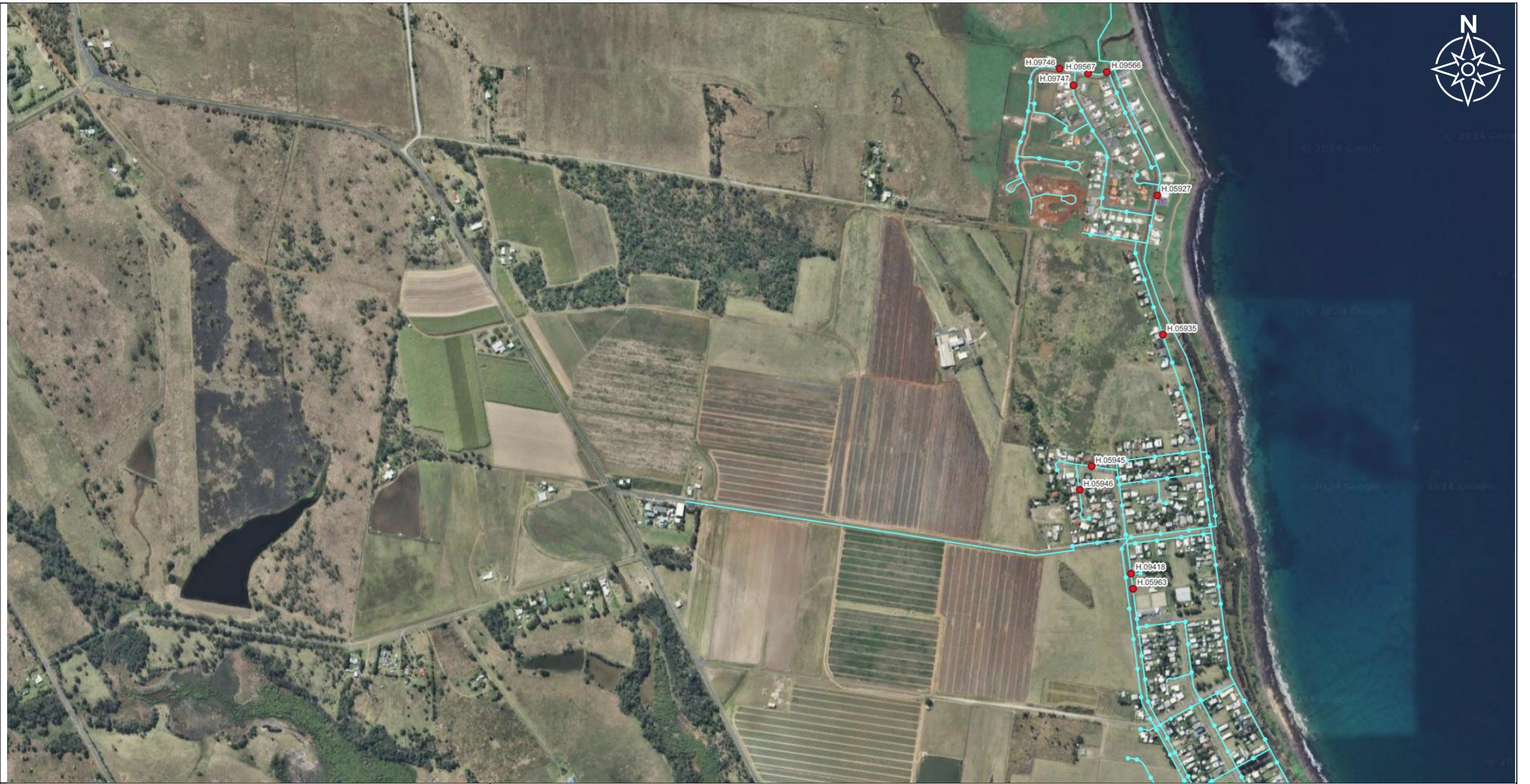
ELLIOTT HEADS HYDRANT FLOW TESTING PLAN SHEET 1 OF 2