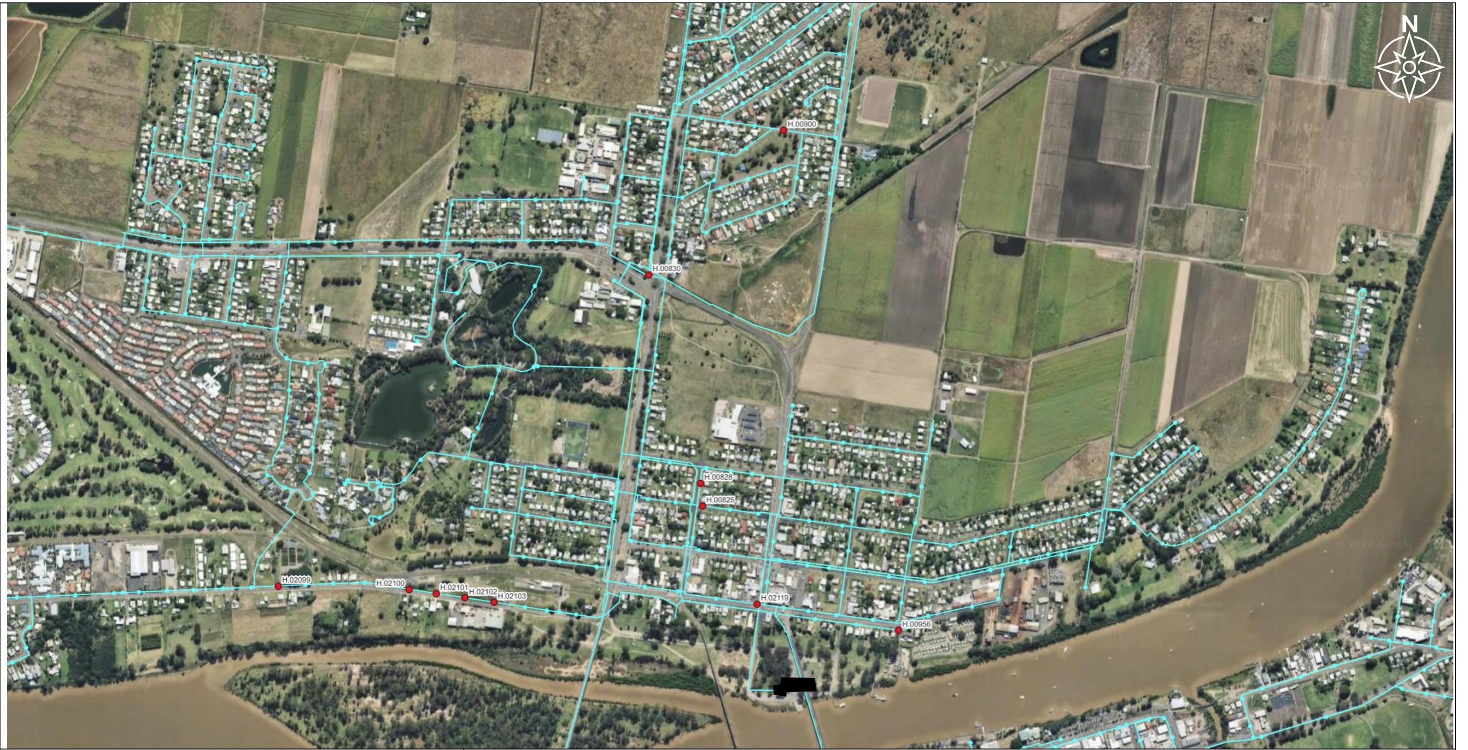
BUNDABERG NORTH HYDRANT FLOW TESTING PLAN SHEET 1 OF 1