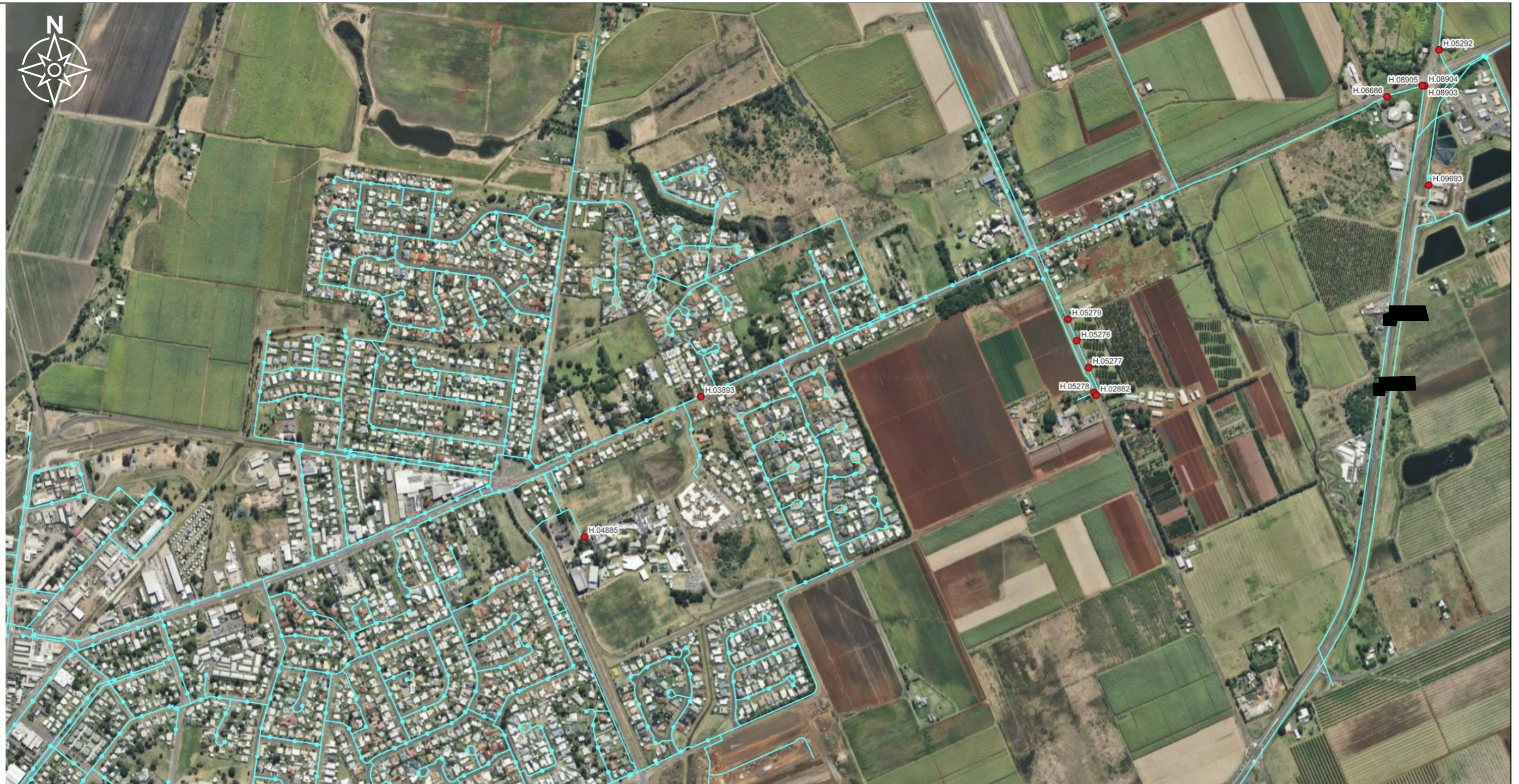
BUNDABERG EAST HYDRANT FLOW TESTING PLAN SHEET 3 OF 3