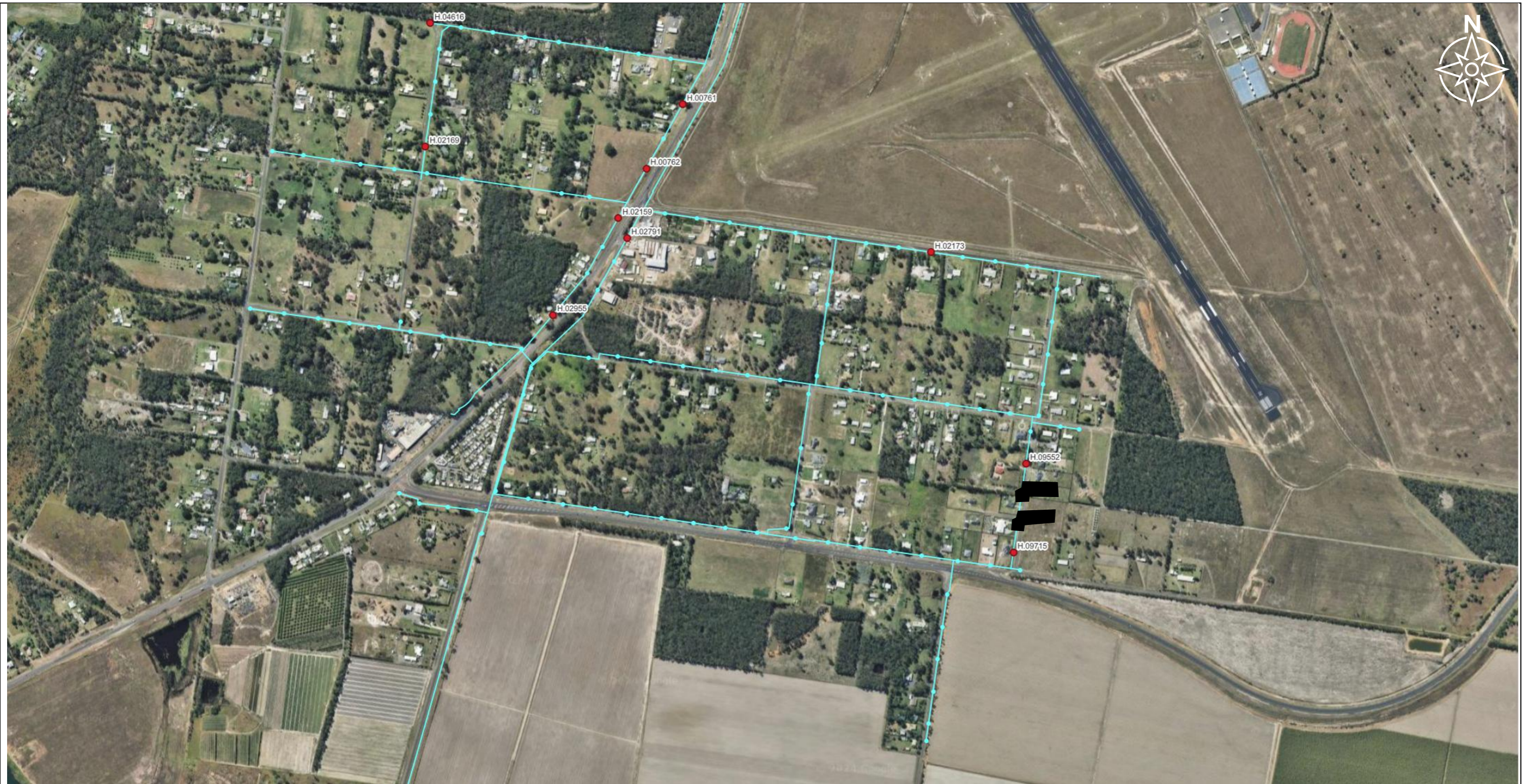
KENSINGTON AND BRANYAN HYDRANT FLOW TESTING PLAN SHEET 1 OF 1