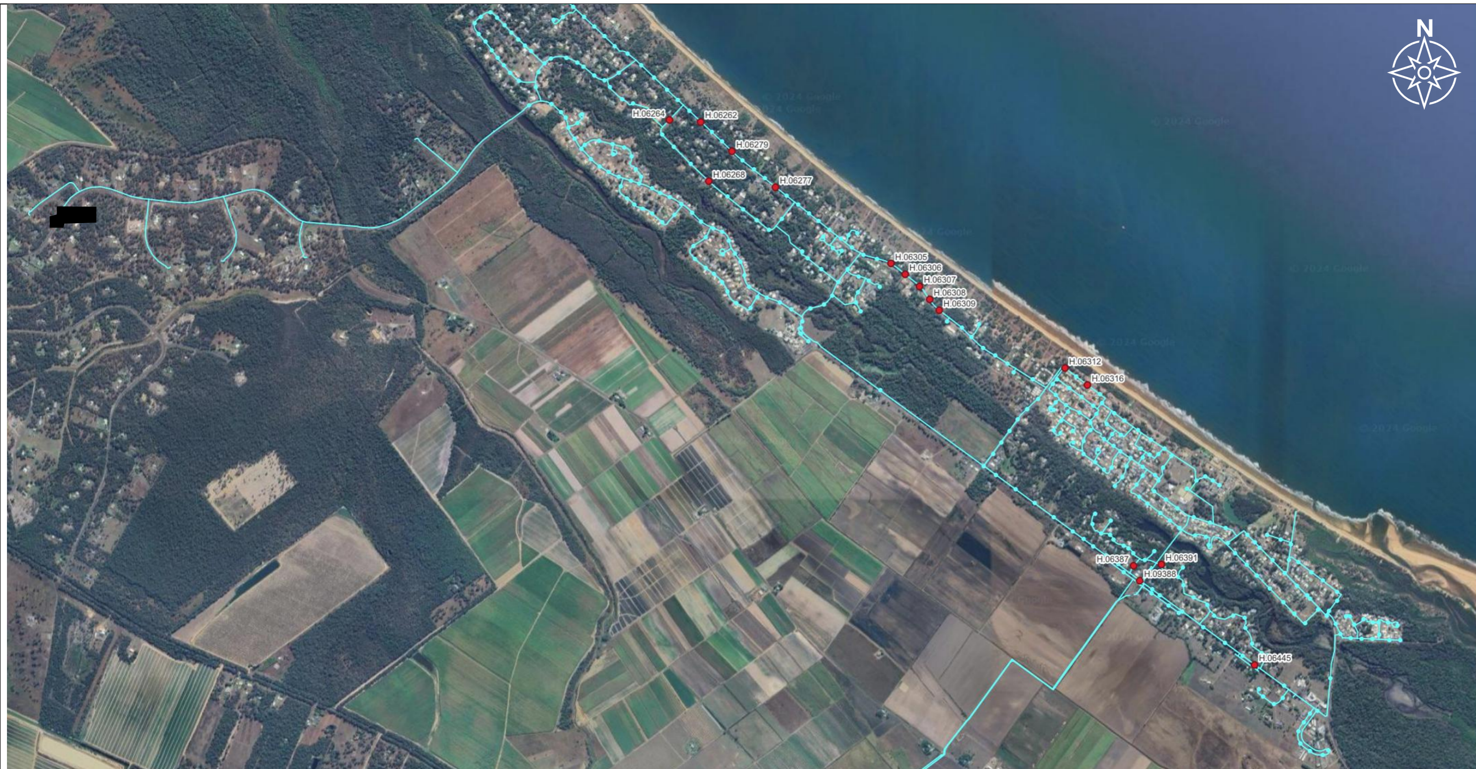
MOORE PARK BEACH HYDRANT FLOW TESTING PLAN SHEET 1 OF 1