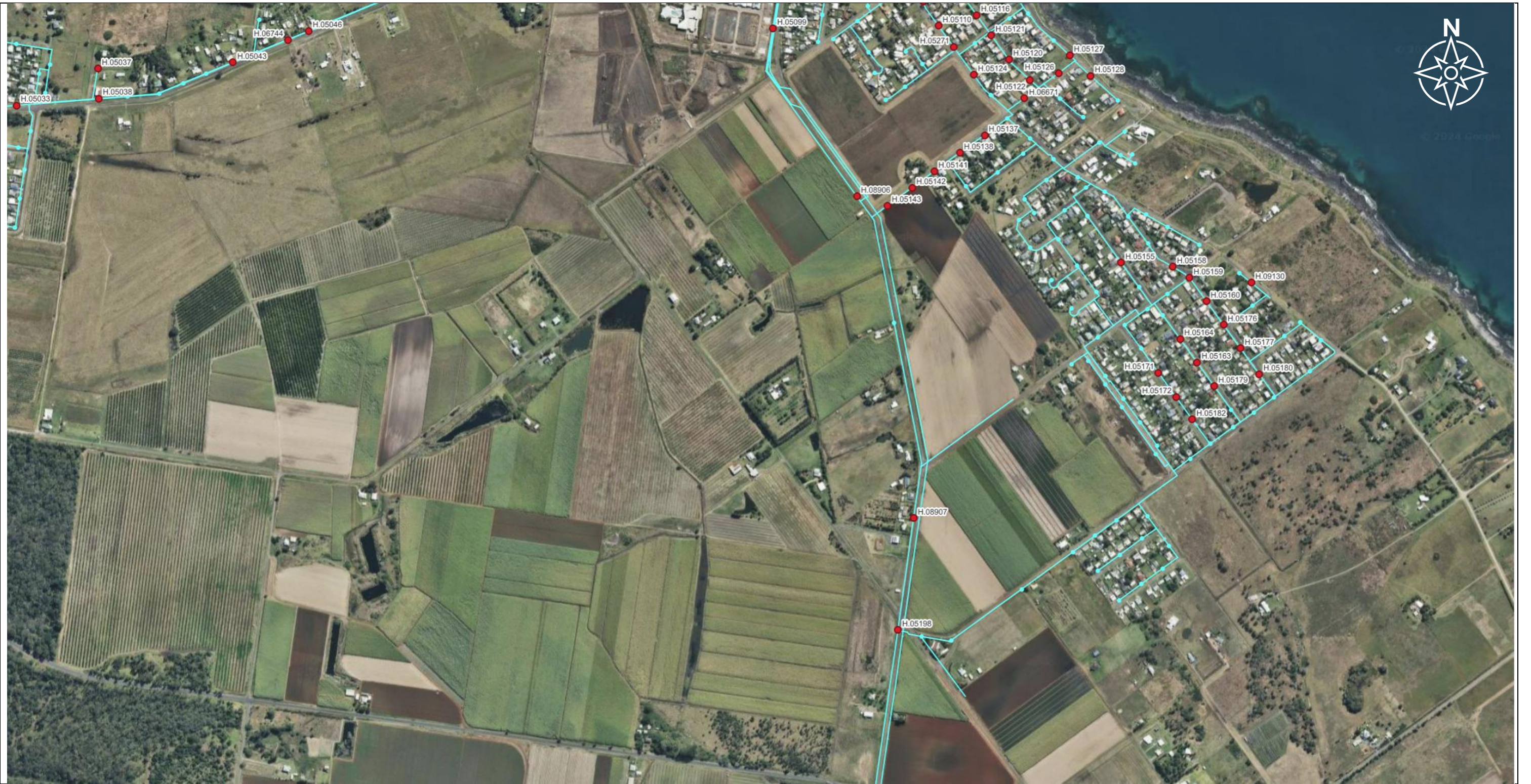
BURNETT HEADS HYDRANT FLOW TESTING PLAN SHEET 2 OF 2