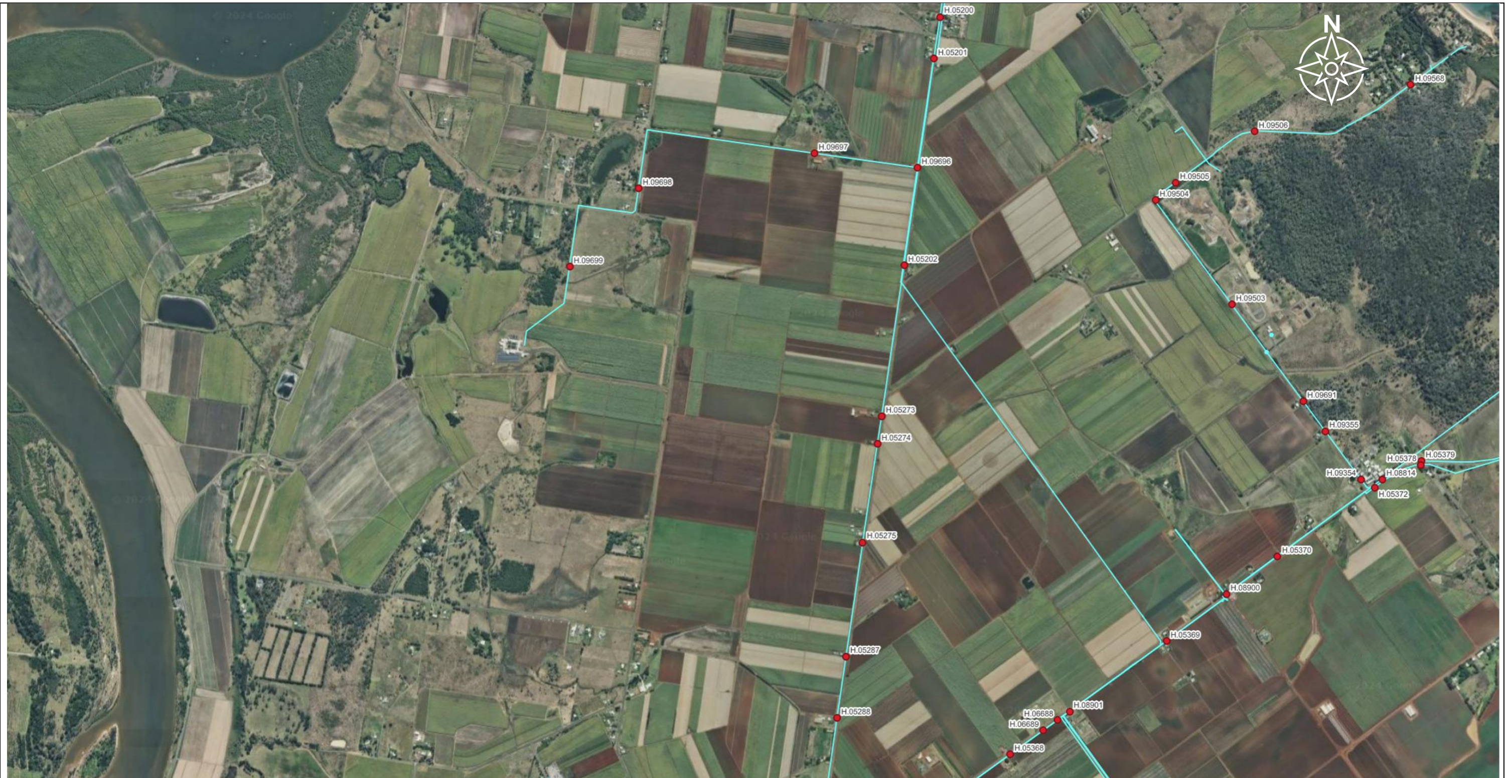
BUNDABERG EAST HYDRANT FLOW TESTING PLAN SHEET 1 OF 3