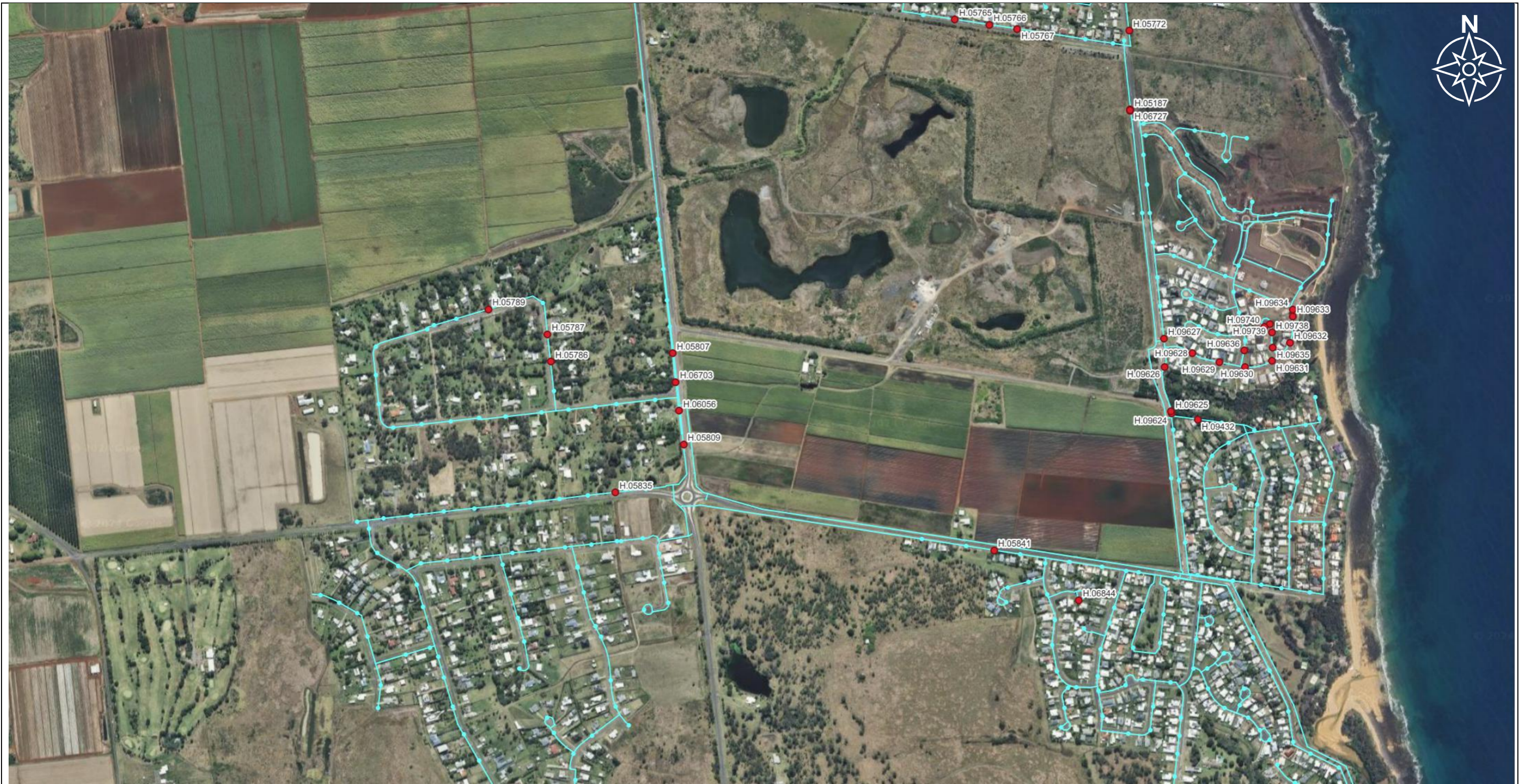
INNES PARK HYDRANT FLOW TESTING PLAN SHEET 1 OF 1