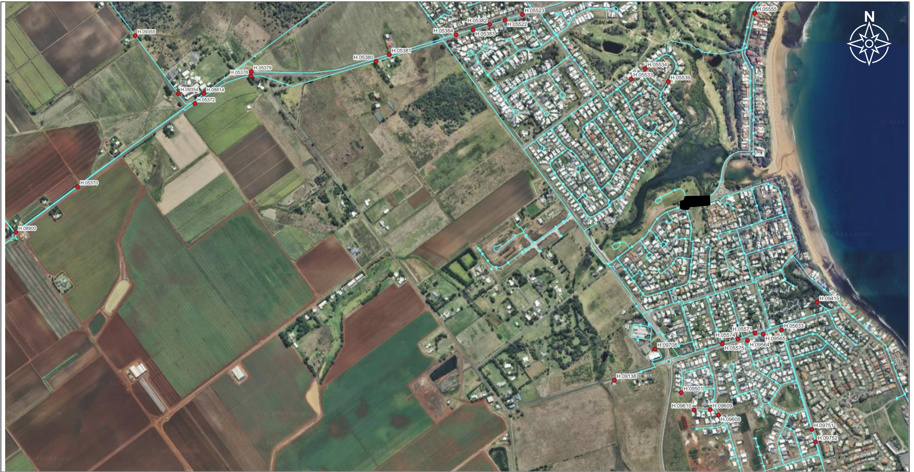
BARGARA HYDRANT FLOW TESTING PLAN SHEET 1 OF 2