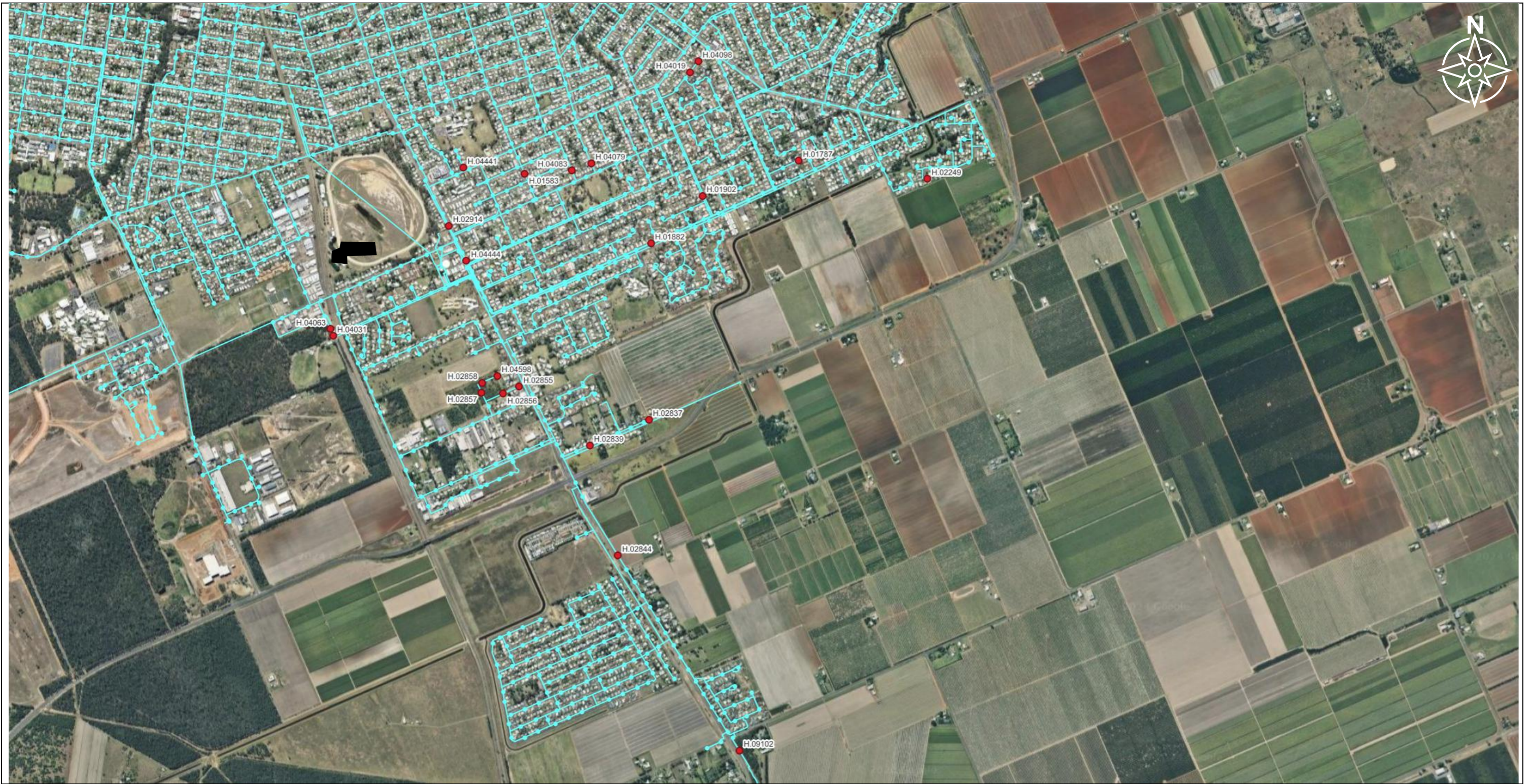
BUNDABERG SOUTH HYDRANT FLOW TESTING PLAN SHEET 1 OF 1