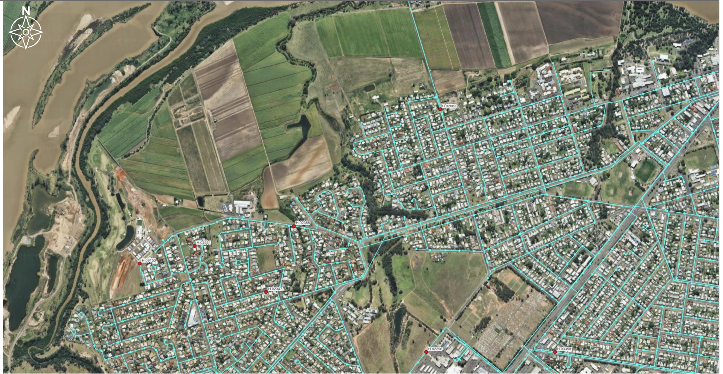
AVOCA HYDRANT FLOW TESTING PLAN SHEET 1 OF 1