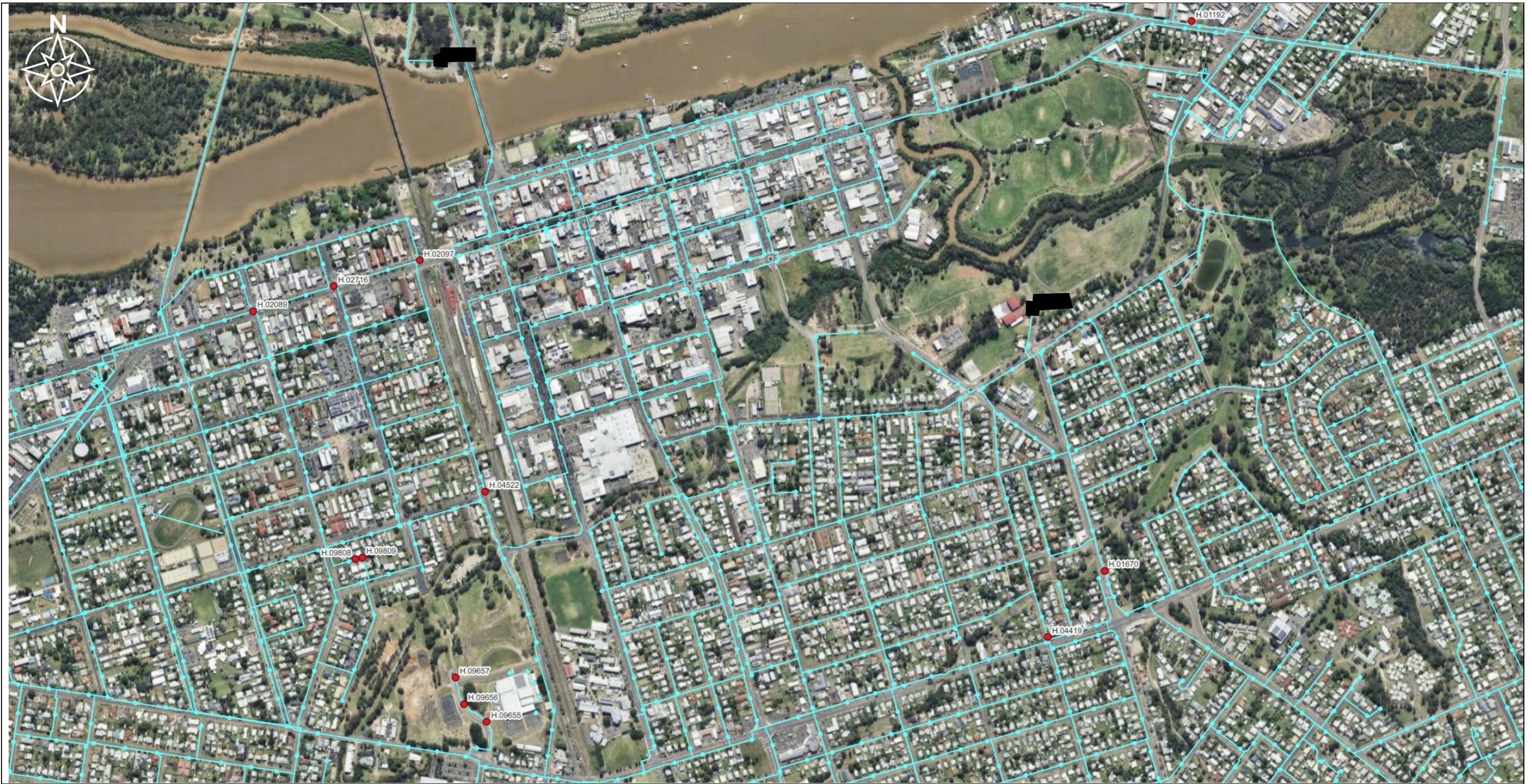
BUNDABERG CENTRAL HYDRANT FLOW TESTING PLAN SHEET 1 OF 1