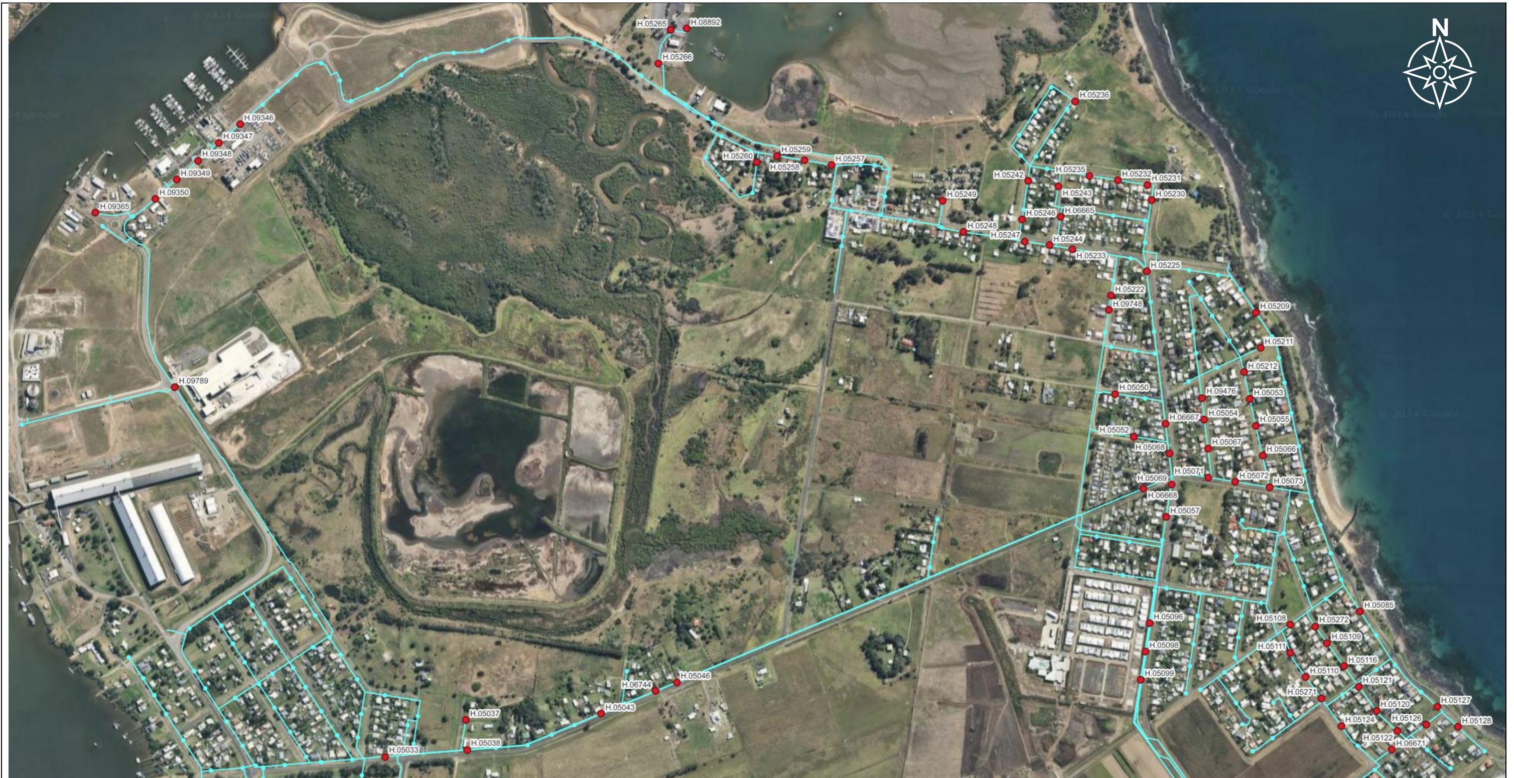
BURNETT HEADS HYDRANT FLOW TESTING PLAN SHEET 1 OF 2