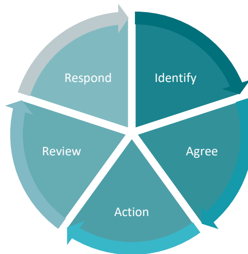
Figure 1: The Local Housing Action Plan Iterative Process

This is an iterative process (see Figure 1) that does not intend to duplicate existing actions of BRC, actions under the Queensland Housing Strategy 2017-2027, or the Housing and Homelessness Action Plan 2021-2025. It seeks to identify opportunities, consider an agreed response, develop targeted actions on key priorities and enable ongoing review of effort to adapt and respond to changing need.