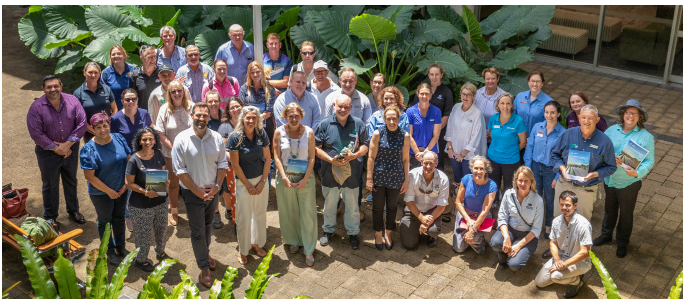
Reef Guardian Council annual meeting