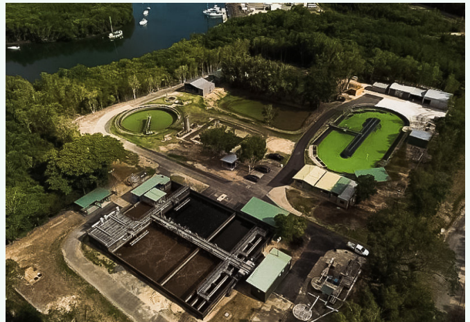
Douglas Shire Council water treatment plant

As an example the Climate Change Initiatives Snapshot showcases the collective actions being taken and the thematic reporting the program provides to promote council actions and advocate for support.