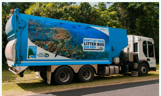
Cassowary Coast Regional Council rubbish collection