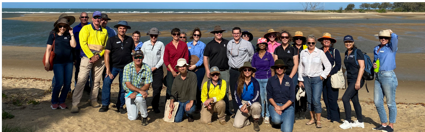
Reef Guardian Council members

The Reef Guardian Council program recognises this and celebrates and supports the important role of local government in the protection and management of the Reef catchment region.