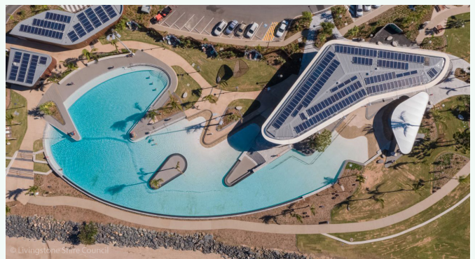
Livingstone Shire Council Yeppoon Lagoon