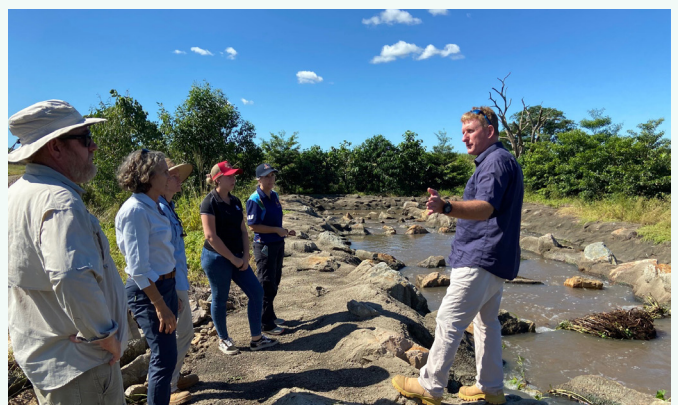
Hinchinbrook Shire Council fish ladders