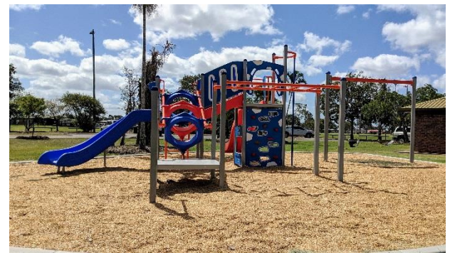
Photos (above): Examples of type of playground unit being considered for Belmont Park, catering for ages 0-12 years.