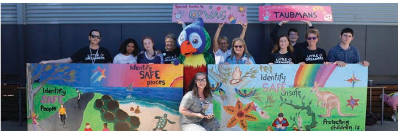
Child Protection Week 2023, Kepnock State School

63 community members attended the creating wellness workshops conducted in Childers.