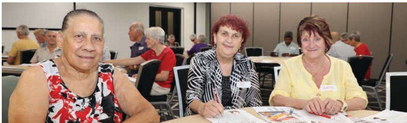
Connect Fest! 2023 Yarning Circle, Bundaberg Multiplex Sport and Convention Centre