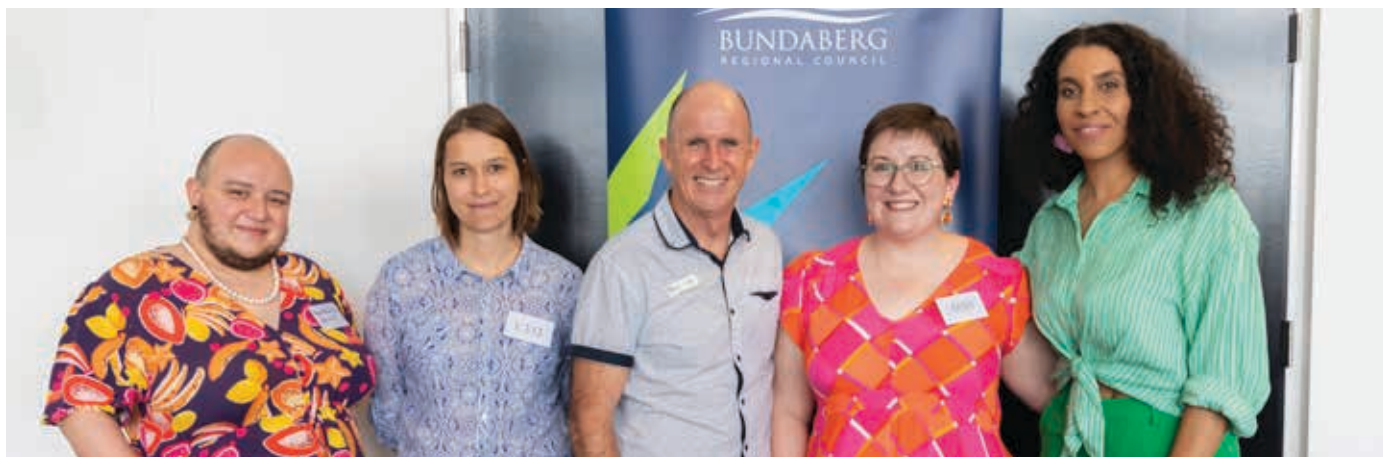
2023 Diversity and Inclusion Forum, Bundaberg Multiplex Sport and Convention Centre