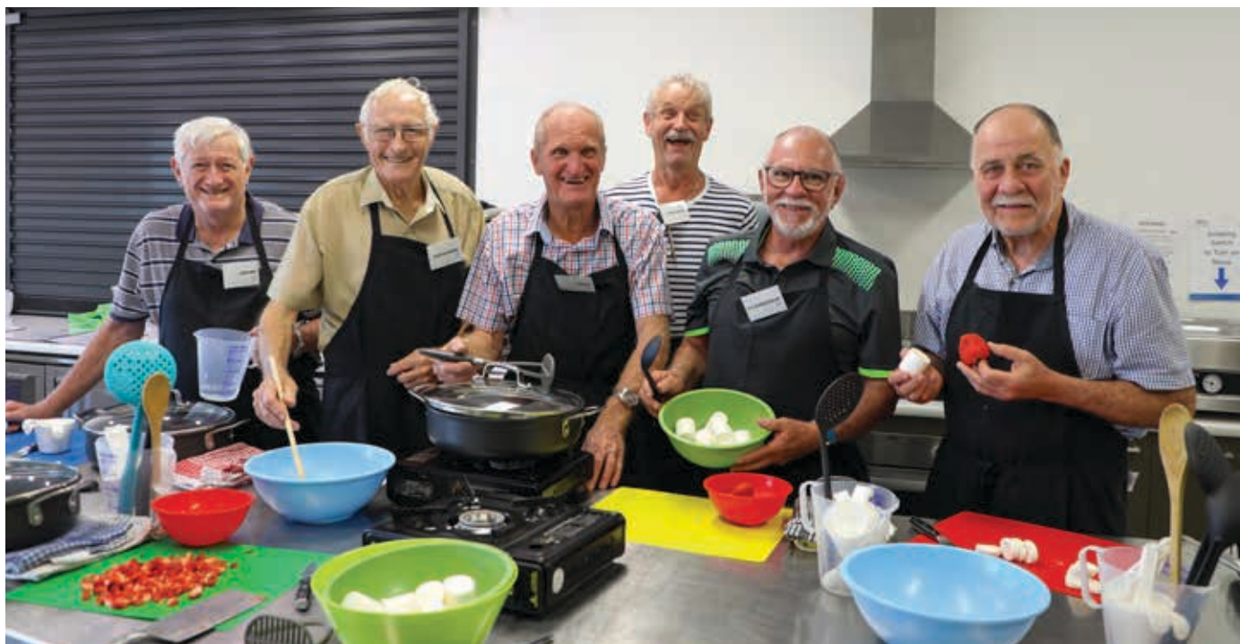
Seniors Month 2023 Cooking Up a Storm program, Bargara Cultural Centre