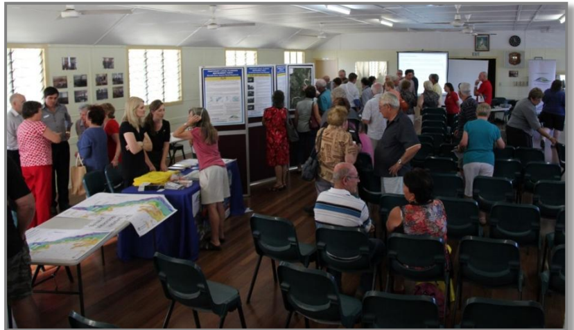
Figure 2 (below): Community Information Sessions, September 2013

The final report of the Burnett River Floodplain Action Plan will describe the region’s vulnerability to large Burnett River floods and outline the floodplain management projects and strategies that will reduce flood impacts and improve the region’s flood resilience and preparedness.