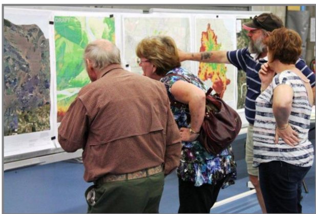
Figure 1: Community Information Sessions, September 2013

Further detailed assessment was undertaken on the eight most promising options from the MCA. This work directly informed GHD's recommended list of projects outlined in the Options Assessment Report.