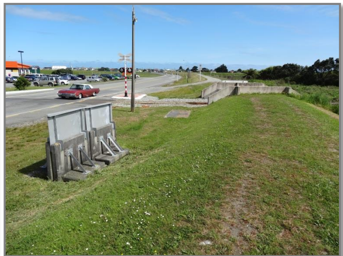
Figure 2 (above): Example of a similar earthen bank levee and floodgate in New Zealand