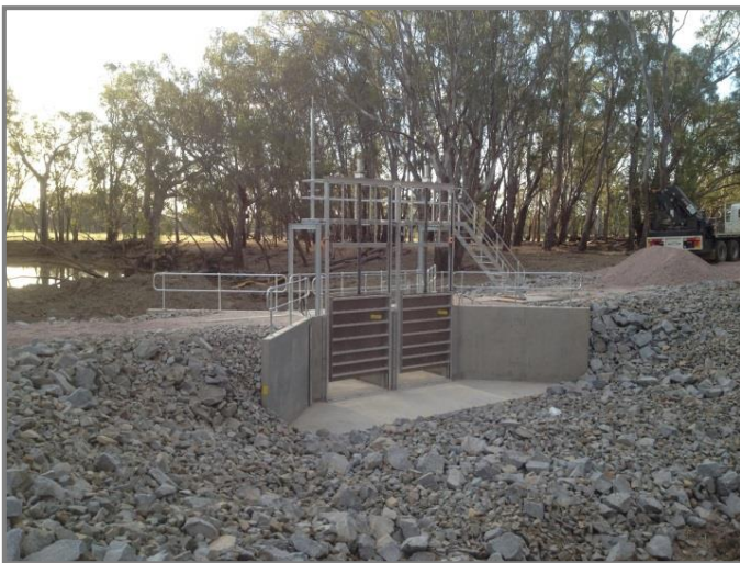
Figure 1 (above): Example of a similar floodgate in Tasmania that would be built near the mouth of Bundaberg Creek