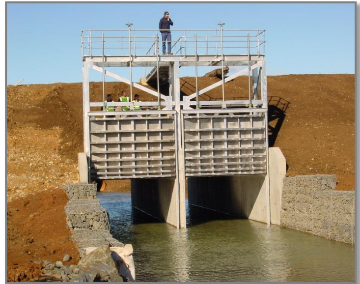
Figure 4: Example of floodgates in operation in Tasmania

Careful planning of the location of a levee is needed to ensure that the levee will not make flooding worse elsewhere. The hydraulic model of the Burnett River was used to address this very issue for a range of levee options. The potential levees were modelled, and the change in flood level outside of the levee was measured. A levee that is properly planned, designed, constructed and managed can substantially reduce a communities' exposure to minor and major floods, which provides an overall benefit even if the levee may still be overtopped in a rare but extreme flood. It is nonetheless important that the community understands this "residual risk", and that there is a management plan in place to deal with this rare overtopping scenario.