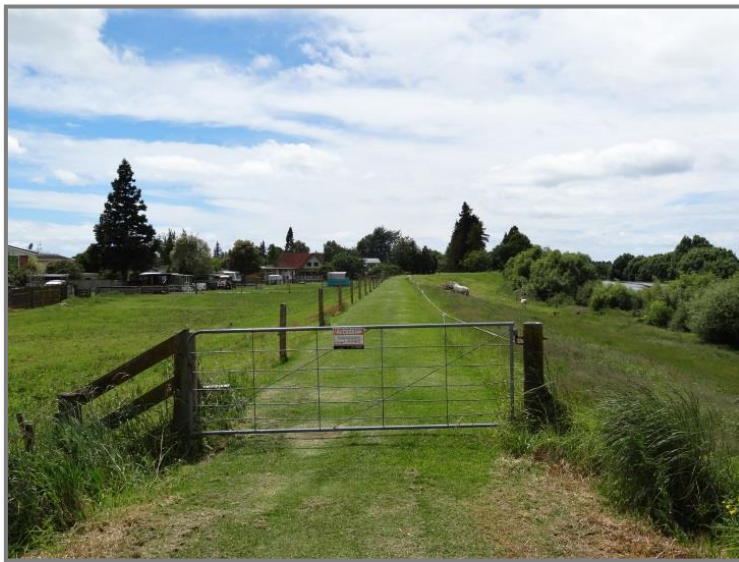
Figure 5: Grassed levee at Edgecombe, New Zealand