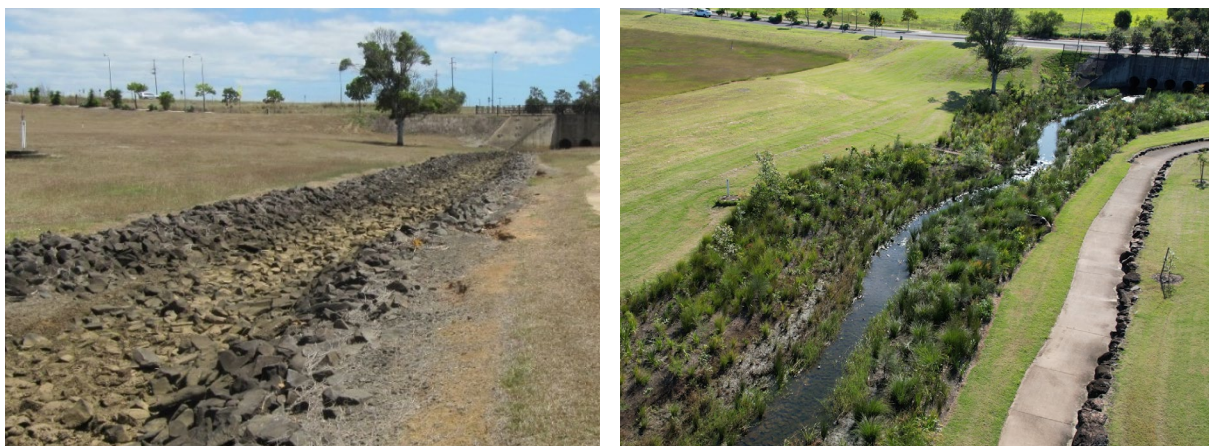
Figure 3 – Belle Eden Park Waterway Naturalisation – Before (Left) | After (Right)

Further details on the project can be found at https://www.ourbundabergregion.com.au/belle-eden-park-waterway-naturalisation .