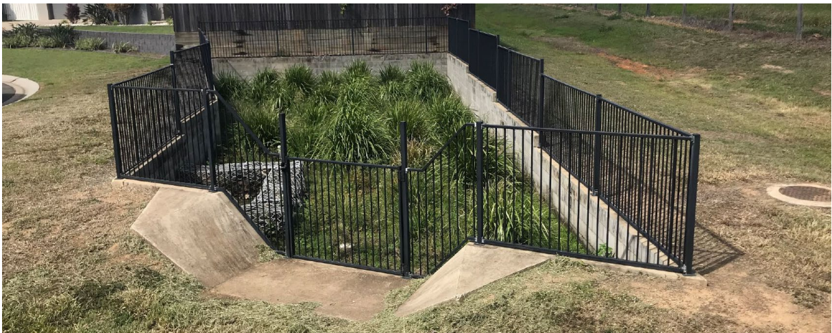
Figure 2 – Bioretention Basin at Kepnock