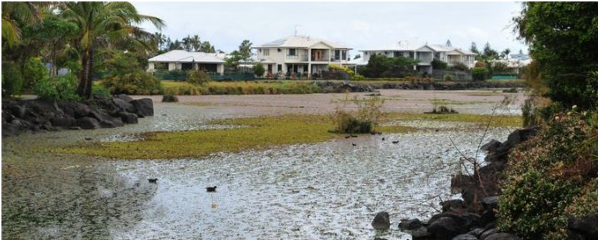
Figure 1 – Urban Lake at Bargara