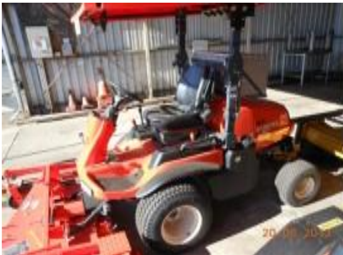
Asset ID 4812 - 2013 Kubota F3680