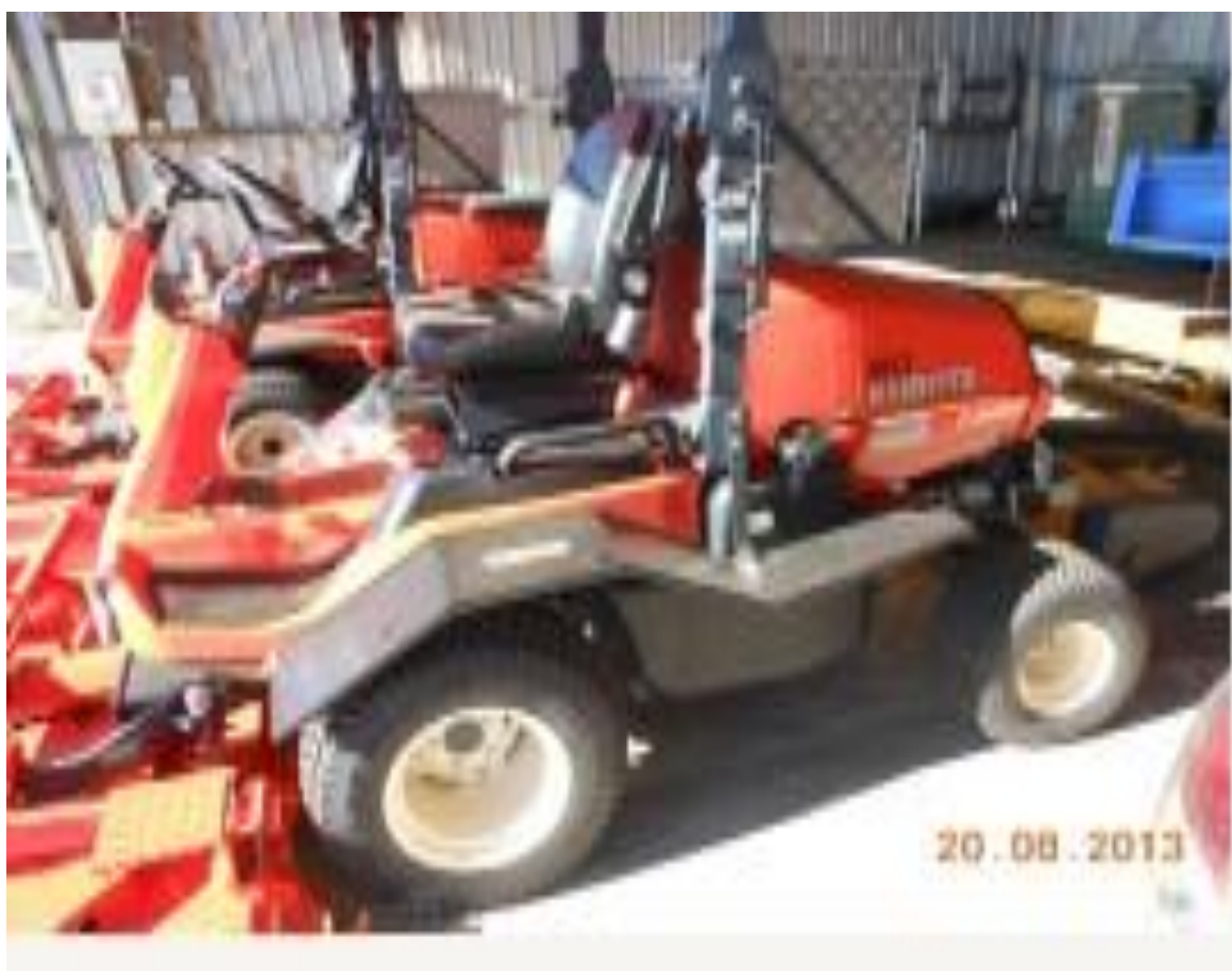
Asset ID 4813 - 2013 Kubota F3680