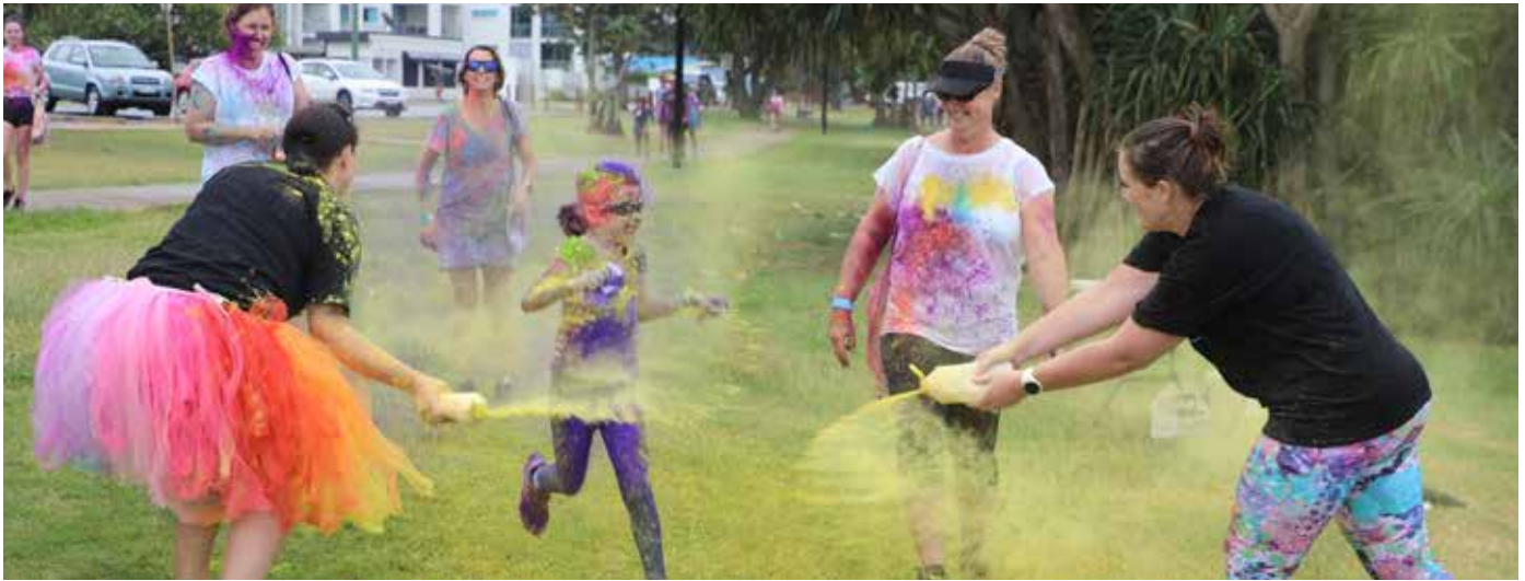
2022 Youth Week Colour Run, Bargarra