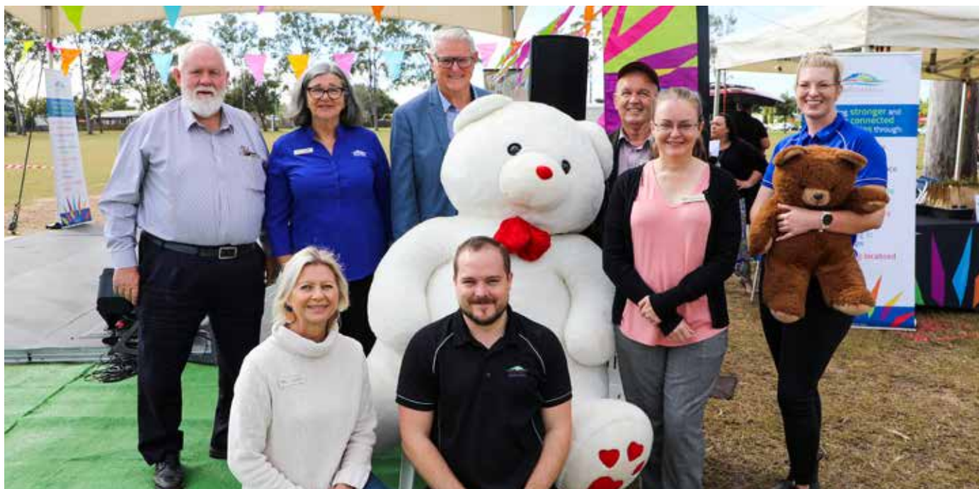
Flourish Family Fun Day 2022, Boreham Park