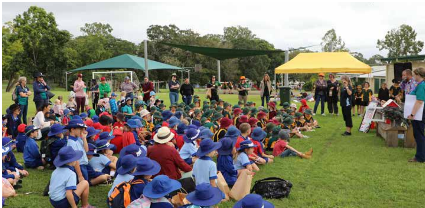
Gin Gin Family Frolics Fun Day 2022, Gin Gin State School