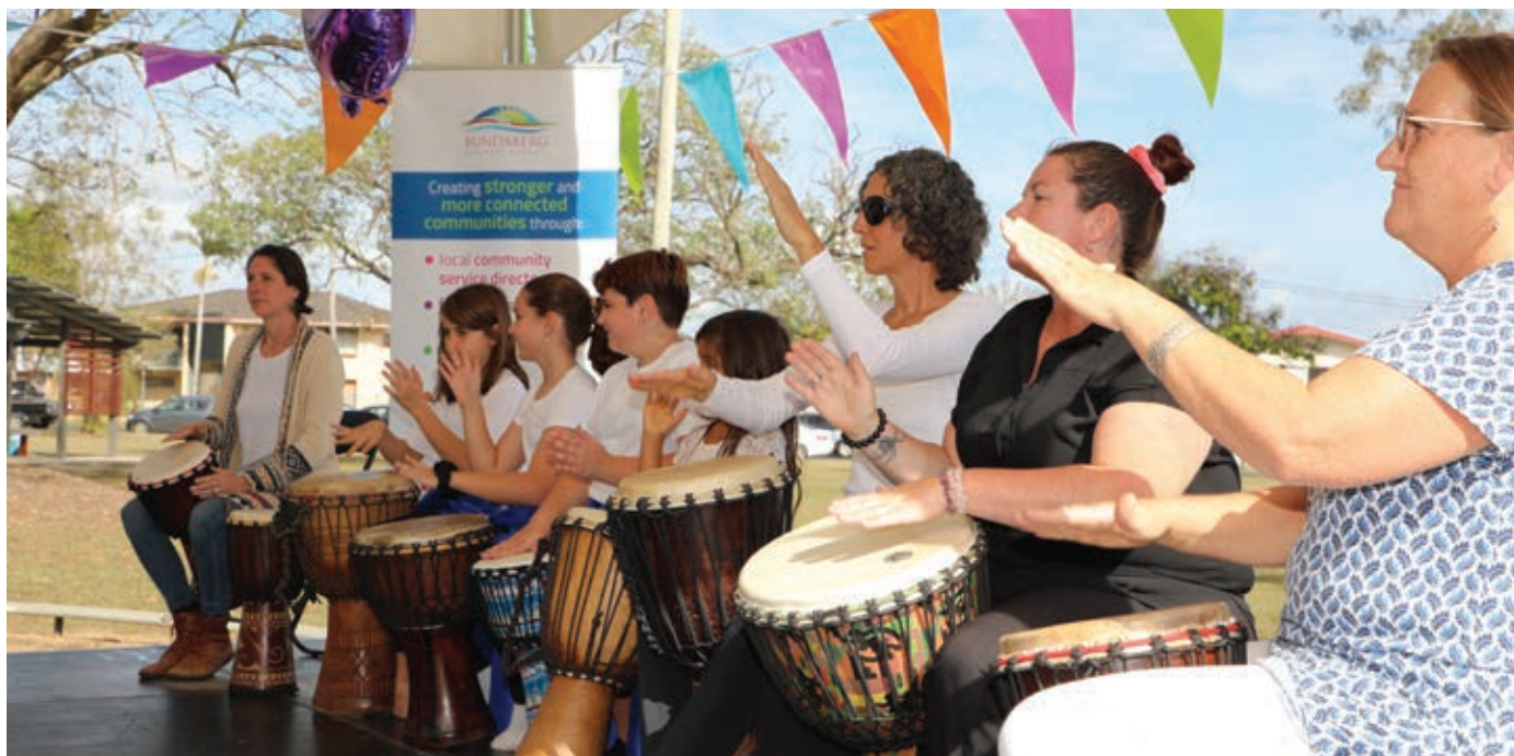
Flourish Family Fun Day 2021, Boreham Park