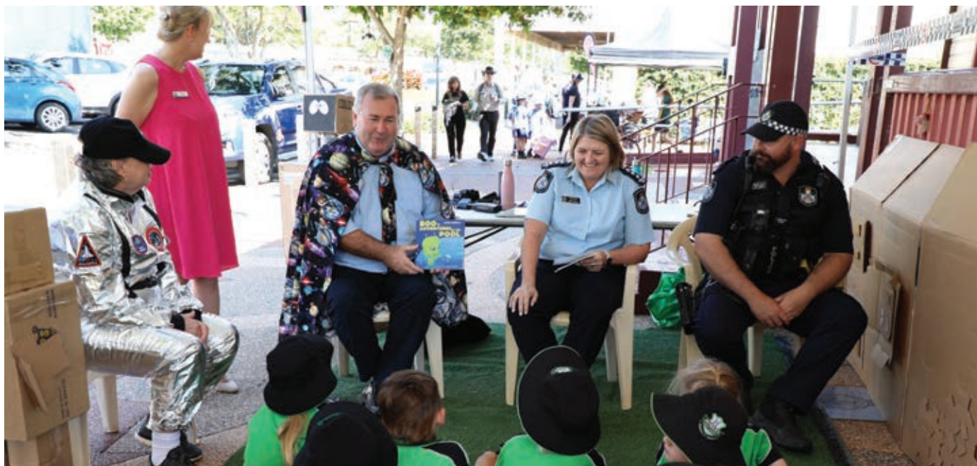
Childers Read to Me Day 2021