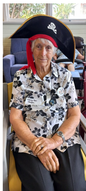
Flaming Hair Morgan