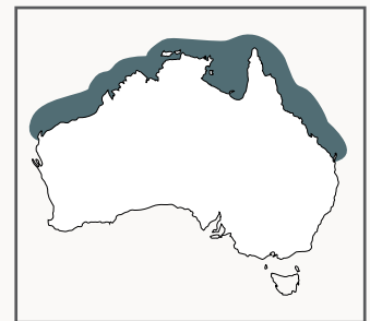
Distribution in Australian waters